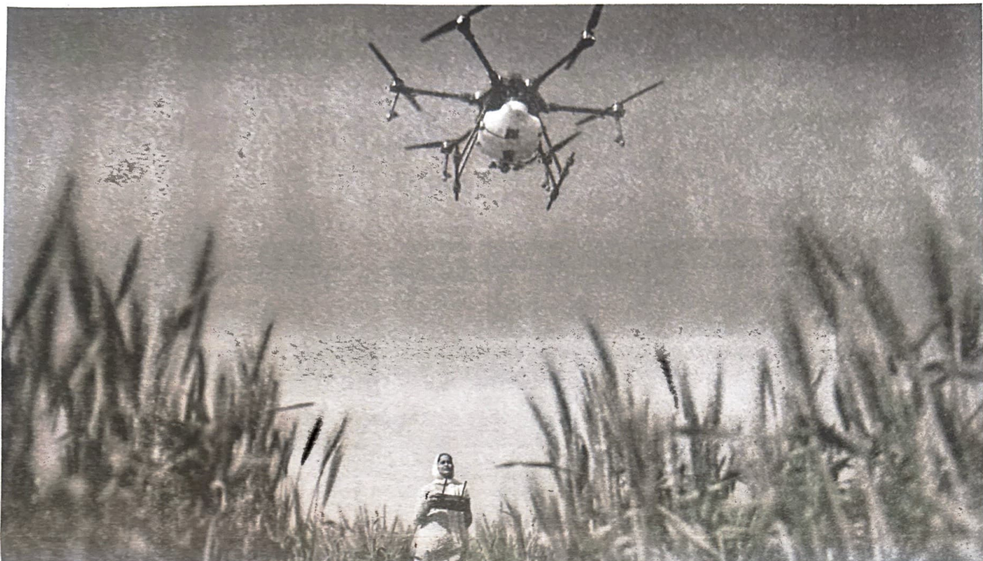
► TAKING FLIGHT: Sharmila Yadav, a remote pilot trained under the 'Drone Sister' programme, operates a drone spraying liquid fertiliser over a farm in Pataudi, India.

Once a housewife in rural India, Sharmila Yadav always wanted to be a pilot and is now living her dream remotely, flying a heavy-duty drone across the skies to cultivate the country's picturesque farmlands.