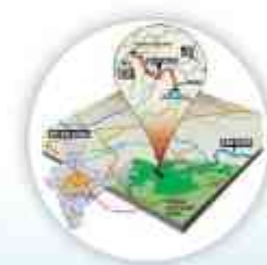
Ken-Betwa link Project