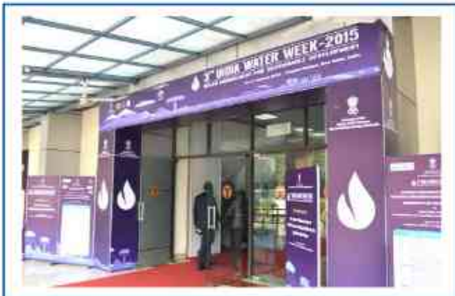
3 rd India Water Week 2015 Theme: Water Management for Sustainable Development