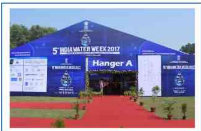
5 th India Water Week 2017 Theme: Water and Energy for Inclusive Growth