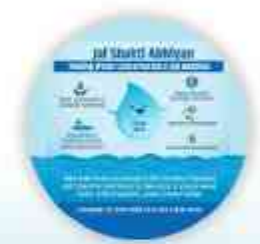
Jal Shakti Abhiyan