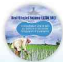
Atal Bhujal Yojana