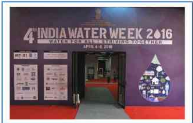
4 th India Water Week 2016 Theme: Water for All: Striving Together