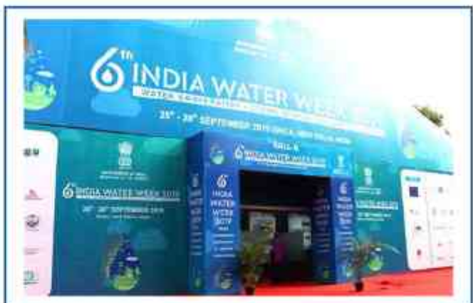
6 th India Water Week 2019 Theme: Water Cooperation– Coping with 21st Century Challenges