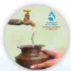
Jal Jeevan Mission