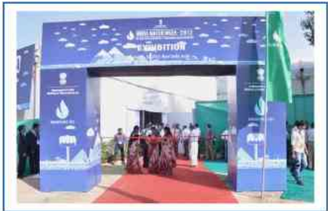
2 nd India Water Week 2013 Theme: Efficient Water Management: Challenges and Opportunities