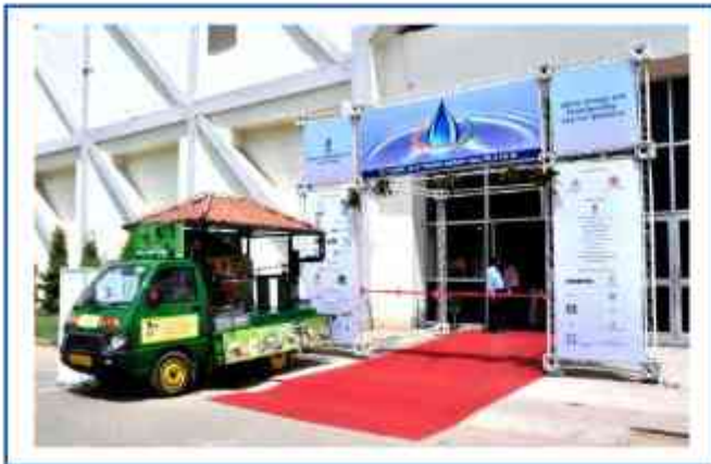
1 st India Water Week 2012 Theme: Water, Energy and Food Security: Call for Solutions