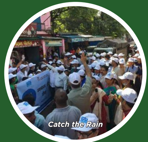
Catch the Rain