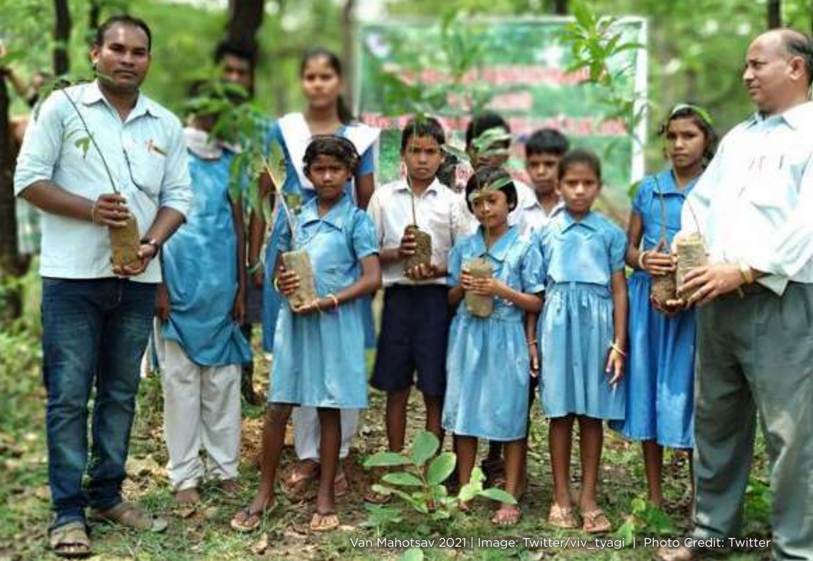
Van Mahotsav 2021