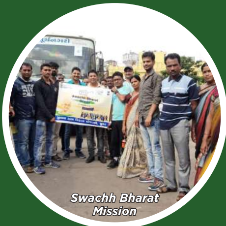
Swachh Bharat Mission

India's per capita CO 2 emissions are 1.8 tonnes, significantly lower than the global average of 4.5 tonnes.