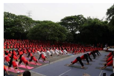
(Yen So Park, Hanoi)