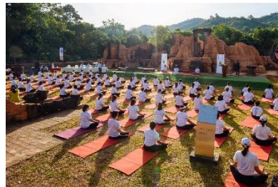
(My Son UNESCO World Heritage Site)

For the past nearly two years, due to the global pandemic situation, the Embassy of India had been mostly promoting Yoga and Yoga-related activities online. This year, as the pandemic situation normalized, the Embassy is shifted back to celebrating the International Day of Yoga in physical mode. Our first "curtain-raiser" event this year under the theme "Yoga for Humanity" was held on 29 May in partnership with the Vietnam Buddhist Sangha at the famous Tam Chuc Pagoda in Ha Nam province. The Embassy then continued organizing the 8th IDY events in eight more cities/provinces of Vietnam, including Hanoi, Da Nang, Vinh Phuc, Thanh Hoa, Quang Ninh, Lao Cai, Thua Thien-Hue and Quang Nam. Many of these included iconic locations of Vietnam. Separately, the Consulate General in HCM City organized IDY events in 15 southern cities/provinces.