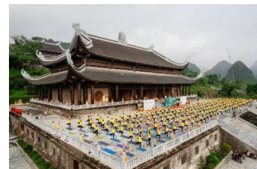
(Tam Chuc Pagoda)