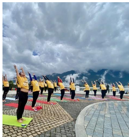
(Sapa, Lao Cai Province)