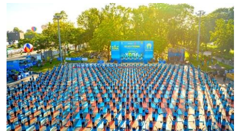
(Thua Thien-Hue Province)